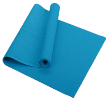
YOGAMATTE PETROL ART.-NR.: 4800196 EAN: 4260365857664