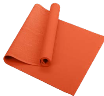
YOGAMATTE ORANGE ART.-NR.: 4800288 EAN: 4260365859408