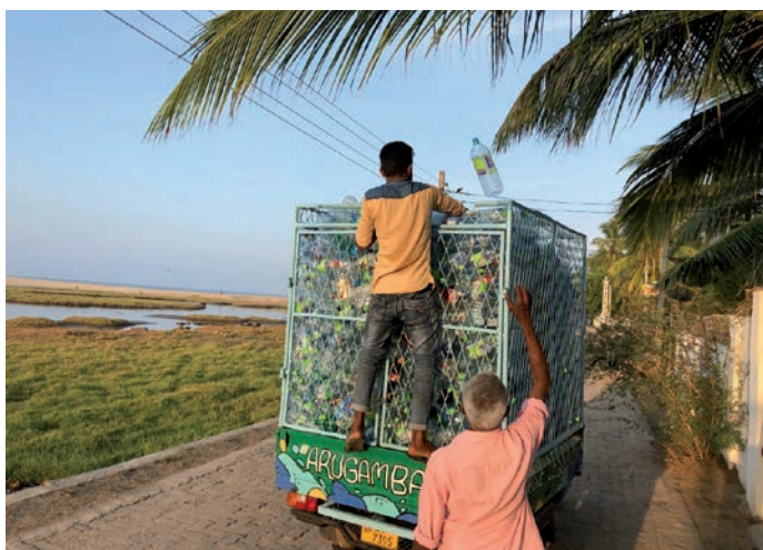
Collecting plastic bottles: Upcycling project on Sri Lanka