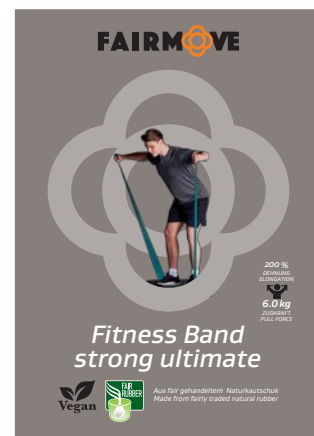
FITNESS BAND STRONG UMTIMATE 200 x 12 CM, SILVER ART.-NO. 4800023 EAN: 4262358580900