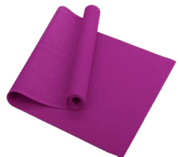
YOGAMATTE PURPLE ART.-NR.: 4800195 EAN: 4260365857640