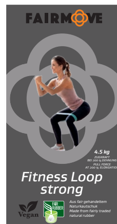
FITNESS LOOP STRONG 30 x 5 CM, BLACK ART.-NO.: 4800056 EAN: 4262358581877