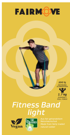
FITNESS BAND LIGHT 200 x 12 CM, YELLOW ART.-NO. 4800018 EAN: 4260365859187