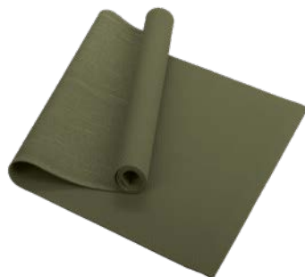
YOGAMATTE OLIVE ART.-NR.: 4800289 EAN: 4260365859422