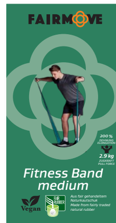
FITNESS BAND MEDIUM 200 x 12 CM, GREEN ART.-NO. 4800020 EAN: 4260365859200