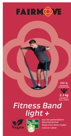
FITNESS BAND LIGHT + 200 x 12 CM, RED ART.-NO. 4800019 EAN: 4262358580870