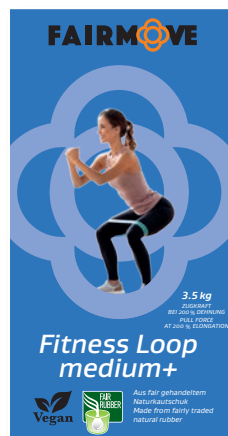
FITNESS LOOP MEDIUM + 30 x 5 CM, BLUE ART.-NO.: 4800052 EAN: 4262358581860