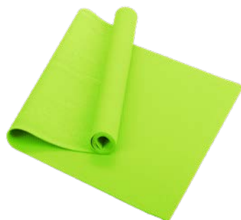
YOGAMATTE GREEN ART.-NR.: 4800065 EAN: 4260663813003