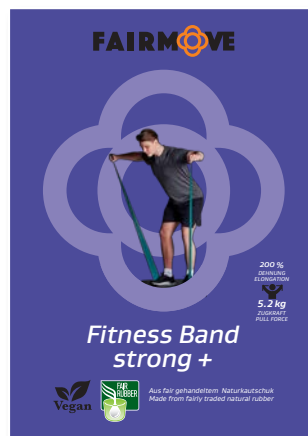
FITNESS BAND STRONG + 200 x 12 CM, PURPLE ART.-NO. 4800022 EAN: 4262358580894