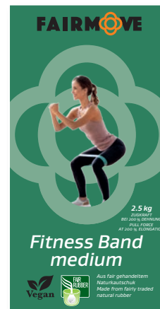
FITNESS LOOP MEDIUM 30 x 5 CM, GREEN ART.-NO.: 4800051 EAN: 4262358581853