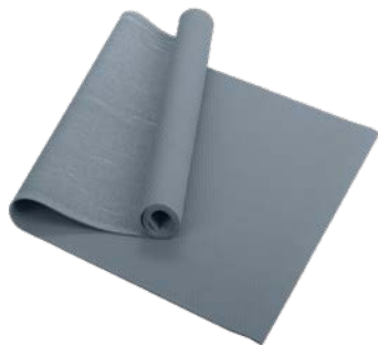
YOGAMATTE HELLGRAU ART.-NR.: 4800197 EAN: 4260365857688