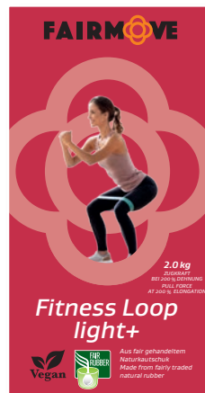
FITNESS LOOP LIGHT + 30 x 5 CM, RED ART.-NO.: 4800050 EAN: 4262358581846