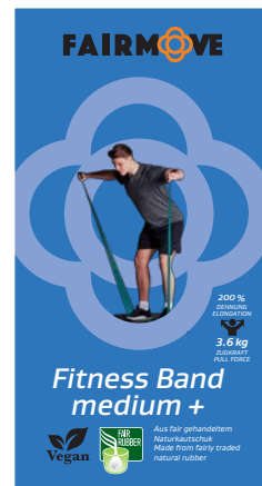
FITNESS BAND MEDIUM + 200 x 12 CM, BLUE ART.-NO. 4800021 EAN: 4262358580887