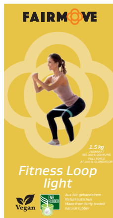
FITNESS LOOP LIGHT 30 x 5 CM, YELLOW ART.-NO.: 4800049 EAN: 4262358581839