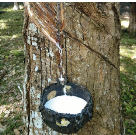
Latex tapper, India

And of course we thank you for your support to include FAIRMOVE in your assortment.