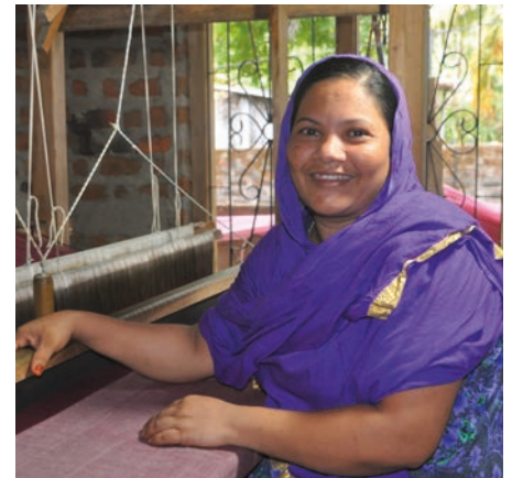
Weaver in Sri Lanka