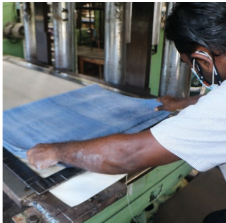
Manufacturing from Yoga mats