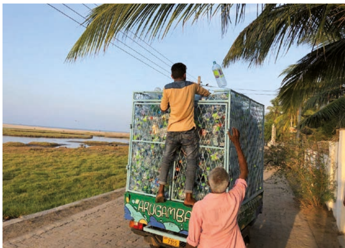
Collecting plastic bottles: Upcycling project on Sri Lanka