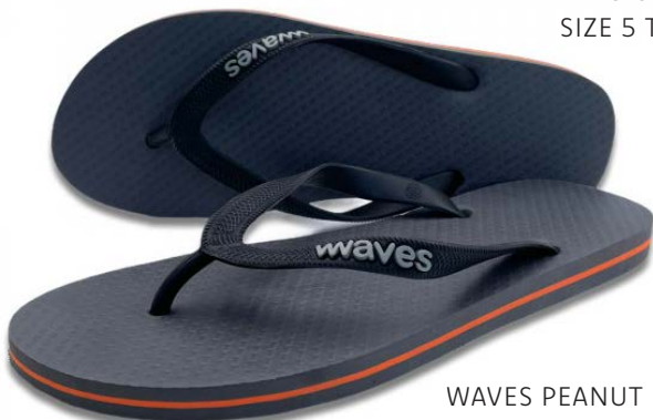
WAVES PEANUT FARM SIZE 5 TO 11