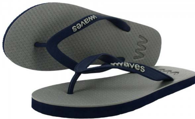
WAVES MIRISSA SIZE 5 TO 11