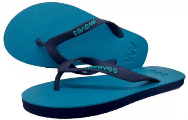
WAVES ARUGAM BAY SIZE 5 TO 11