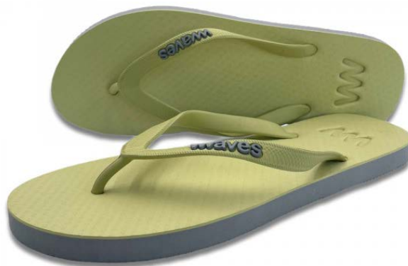
WAVES OKANDA SIZE 5 TO 11