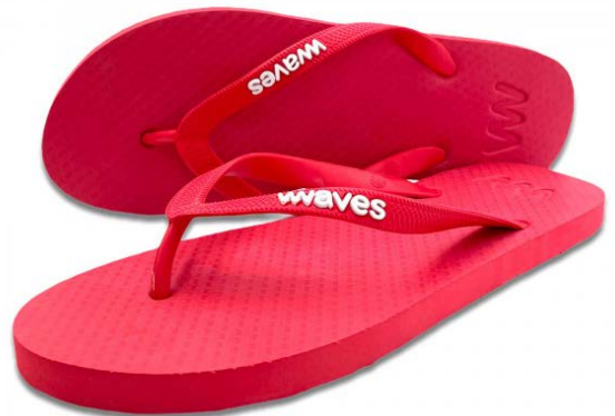
WAVES BEACH BREAK SIZE 3 TO 11