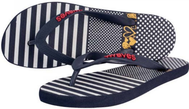
WAVES ANHANGAMA SIZE 3 TO 7