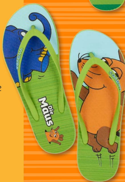
DieMaus flip flops “Duo” Size 30 to 34