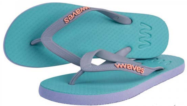
WAVES MIDIGAMA SIZE 3 TO 7