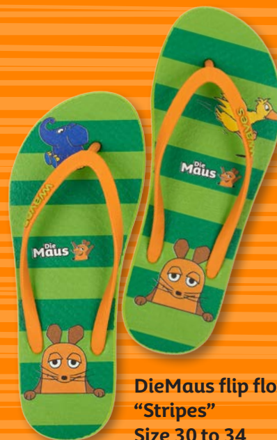
DieMaus flip flops “Stripes” Size 30 to 34