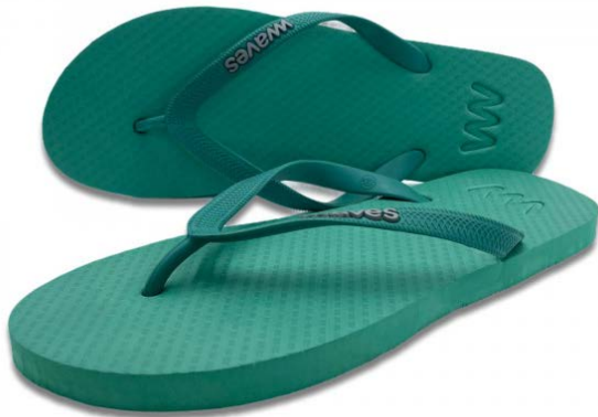
WAVES DEWATTA SIZE 3 TO 11