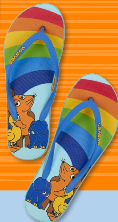
DieMaus flip flops “Rainbow” Size 30 to 34