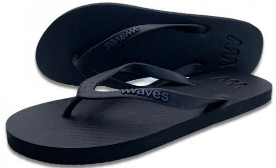
WAVES RAMS SIZE 3 TO 11