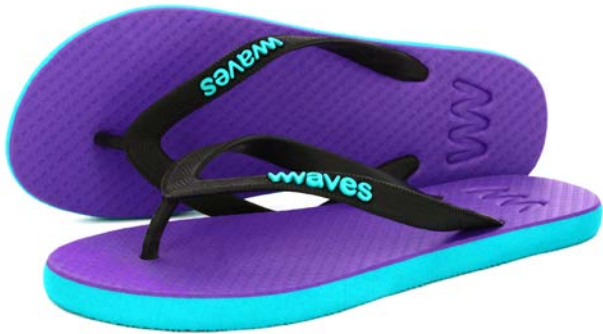
WAVES WHISKEY POINT SIZE 3 TO 7