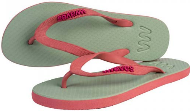
WAVES DICKWELLA SIZE 3 TO 7