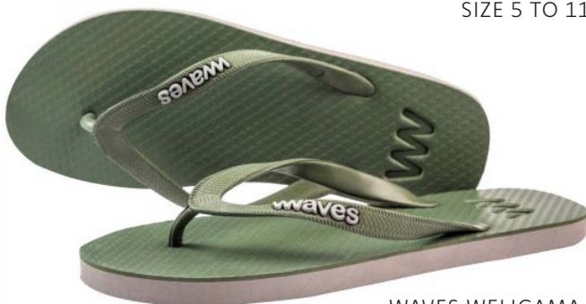
WAVES WELIGAMA SIZE 5 TO 11