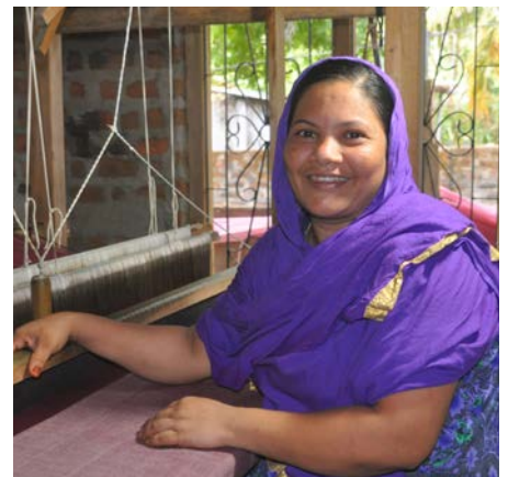
Weaver in Sri Lanka