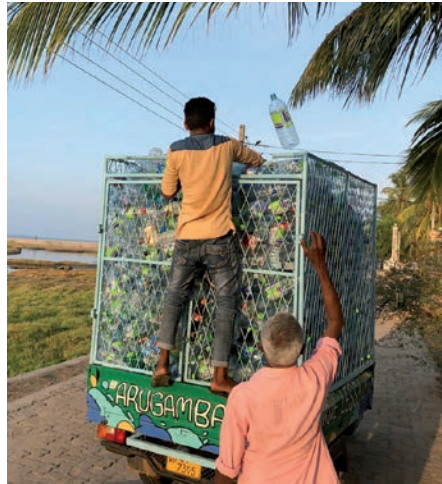
Collecting plastic bottles: Upcycling project on Sri Lanka