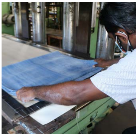
Manufacturing from Yoga mats