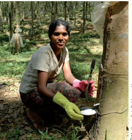
Sustainable cultivation: Latex tapper in India