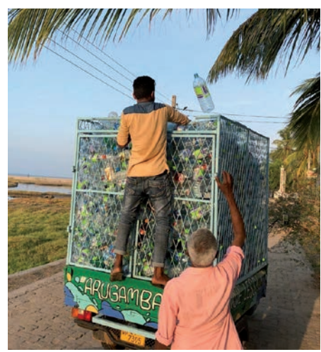
Collecting plastic bottles: Upcycling project on Sri Lanka