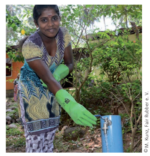
Access to fresh water: Fountain project on Sri Lanka