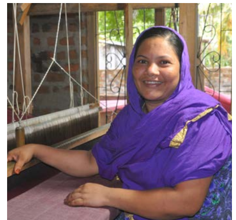
Weaver in Sri Lanka