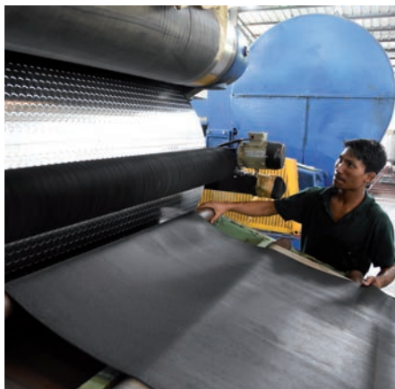
Manufacturing from Yoga mats