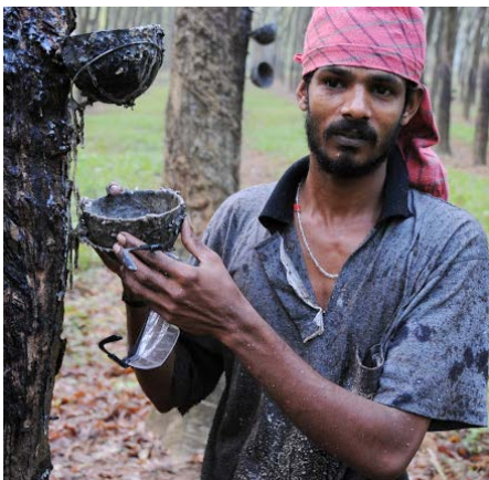
Latex tapper in Sri Lanka

And of course we thank you for your support to include FAIRMOVE in your assortment.