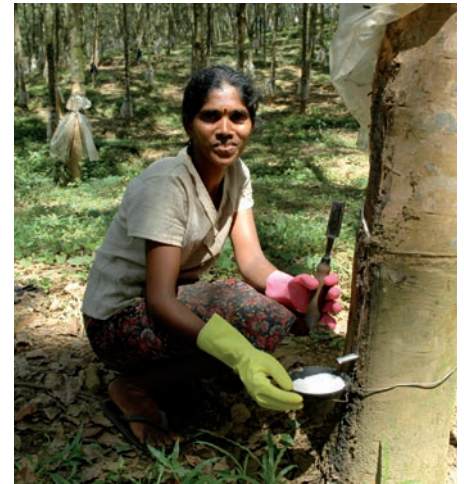
Sustainable cultivation: Latex tapper in India