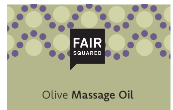
Olive Massage Oil

2500 ML COSMETAINER ART.-NO.: 4910494 EAN: 4260663810927