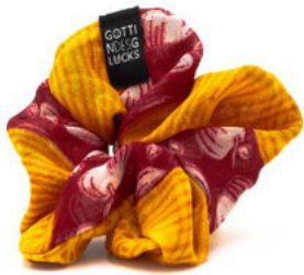
SCRUNCHIES 491 0479