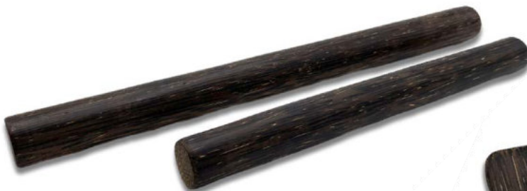
LENGTH: 21 CM, WIDTH: 15 CM, HEIGHT: 6,5 CM 4800292

Handmade jewelry box from kithul wood with subdivision for better assortment.