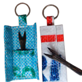
FRENCH FRIES TO GO – FRIES SET