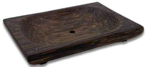
SOAP TRAY MAXI LENGTH: 16 CM, WIDTH: 10,6 CM HEIGHT: 1,4 CM 4800080