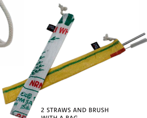
2 STRAWS AND BRUSH WITH A BAG

made of rice sack, fed on the inside with hand-woven, undyed cotton fabric.