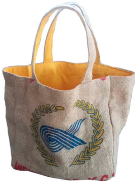
BEACH BAG / TOTE

HEIGHT: 32 CM, WIDTH: 38 CM, DEPTH: 10 CM, 4800283