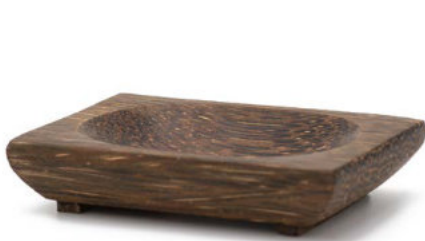
SOAP TRAY MIDI LENGTH: 11 CM, WIDTH: 8 CM 4800246

Our products are handmade from Kithul palms on the south coast of Sri Lanka. Kithul is a very strong wood with a beautiful grain. Only those kithul palms are used, which can no longer be used agriculturally.