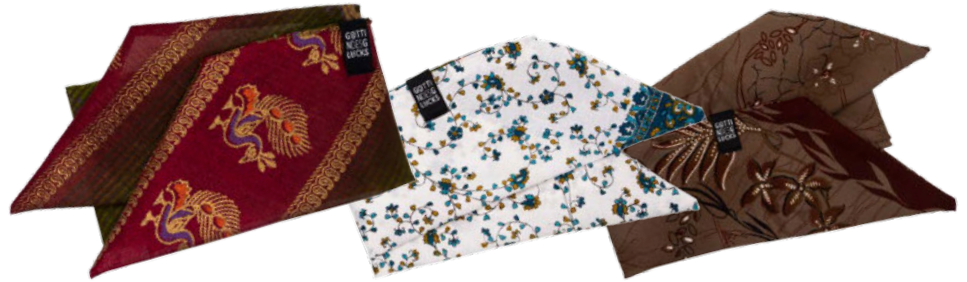
HAIR BANDS 491 0480