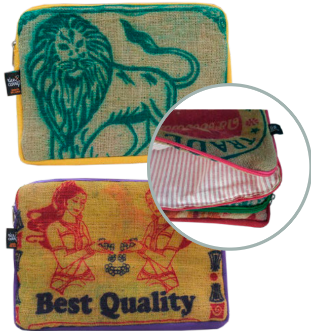
LAPTOP OR TABLET BAG

HEIGHT: 36 CM, WIDTH: 36 CM, DEPTH: 18 CM, 4800284