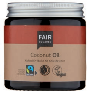
COCONUT OIL (ORGANIC)

100 ML JAR, ART.-NO.: 4910305 EAN: 4260365850993