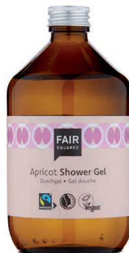
SHOWER GEL APRICOT

2500 ML COSMETAINER, ART.-NR.: 4910476 EAN: 4260663810835