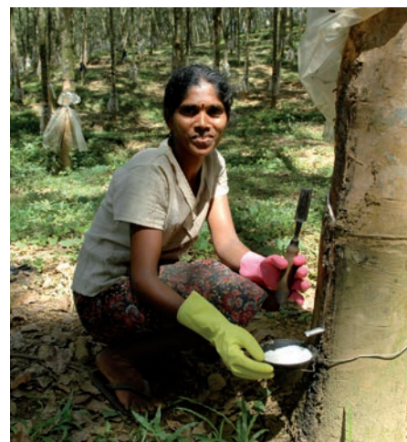
Sustainable cultivation: Latex tapper in India