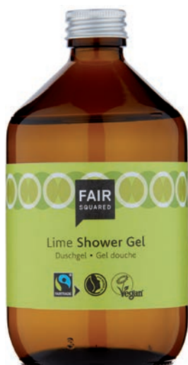
SHOWER GEL LIME

Shower gel for dry or sensitive skin. Olive oil has been used for centuries to gently cleanse and moisturize the skin. Olive oil is rich in natural vitamins, minerals and essential fatty acids that can rejuvenate the skin with its anti-aging properties. Pampers your skin with a fresh scent of lime.