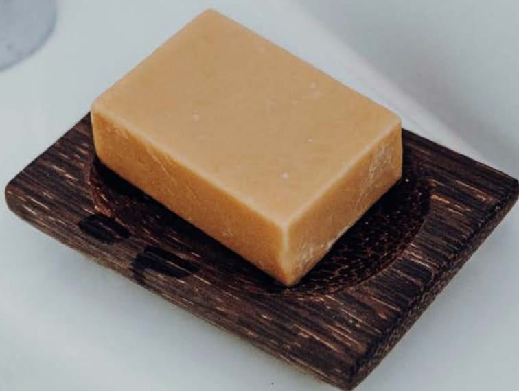
FAIR TRADE SOAP DISH MIDI MADE FROM THE KITHUL PALM TREE