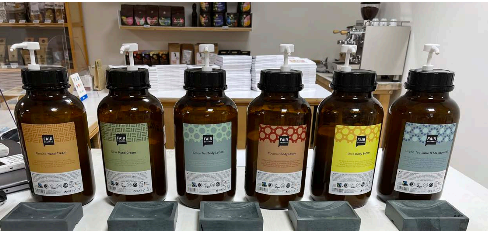
Presentation at FAIRFOOT, Basel