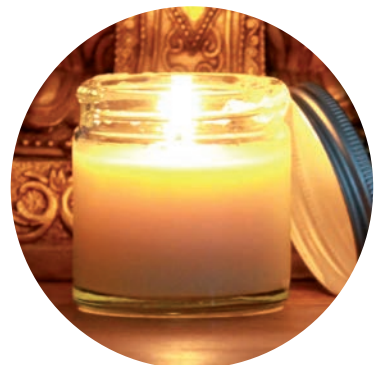
MASSAGE CANDLE SHEA

2500 ML COSMETAINER, ART.-NO.: 4910491 EAN: 4260663810972