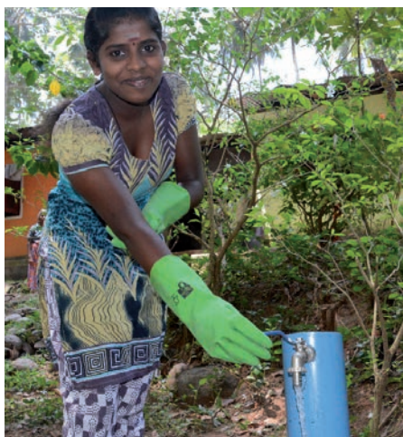
Access to fresh water: Fountain project on Sri Lanka