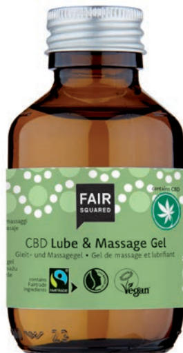
LUBE & MESSAGE GEL CBD

2500 ML COSMETAINER, ART.-NO.: 4910494, EAN: 4260663810927