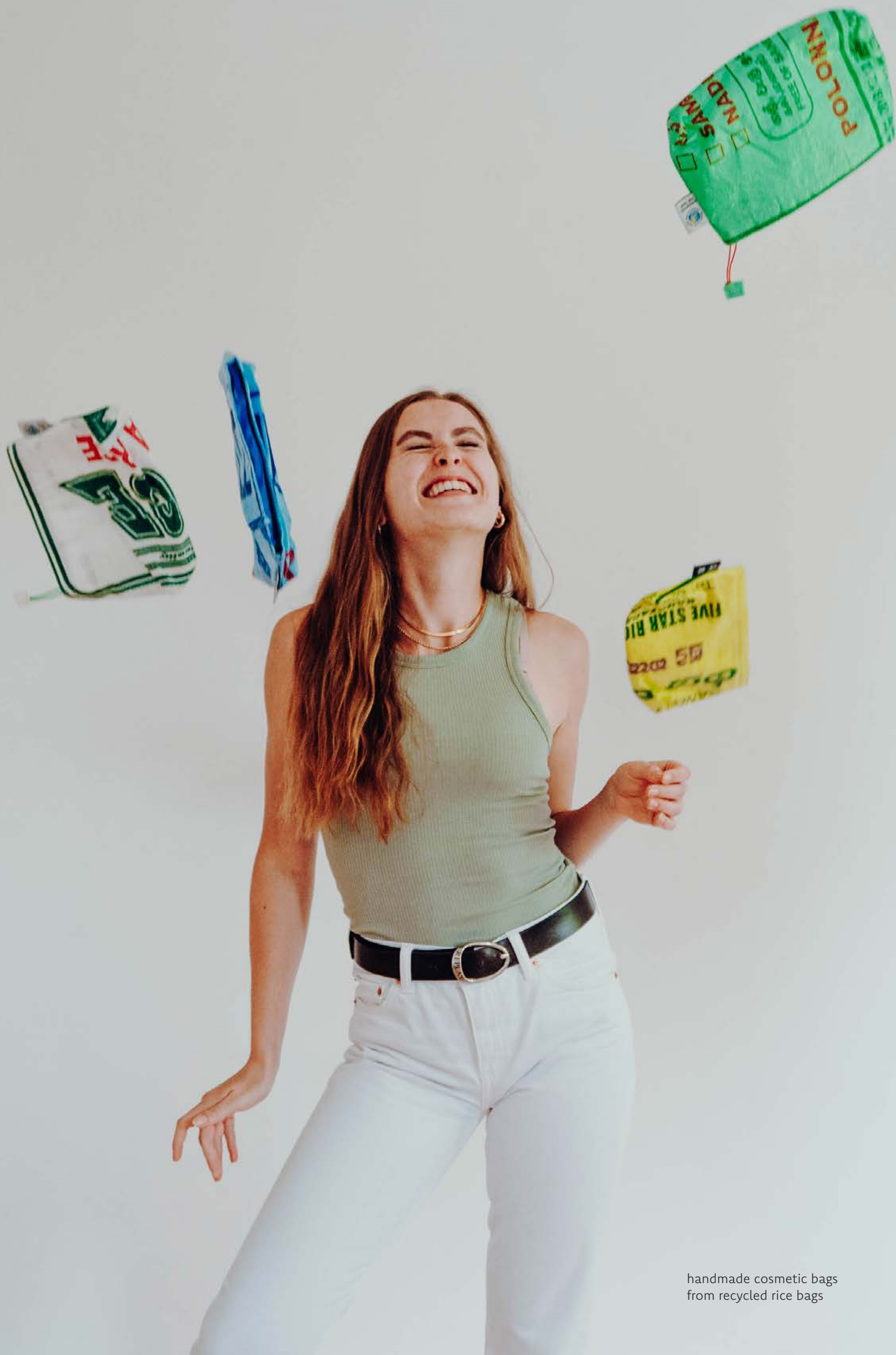
handmade cosmetic bags from recycled rice bags