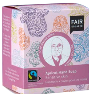
HAND SOAP APRICOT SENSITIVE SKIN

A hand soap for sensitive hands. With mild, saponified apricot kernel oil, the hands are gently and sustainably cleaned and cared for. Superfating level: 7%