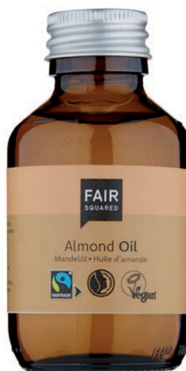
ALMOND OIL (ORGANIC)

100 ML BOTTLE, ART.-NO.: 4910301 EAN: 4260365850931