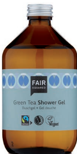
SHOWER GEL GREEN TEA

2500 ML COSMETAINER, ART.-NR.: 4910477 EAN: 4260663810842