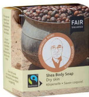
BODY SOAP SHEA DRY SKIN

2500 ML COSMETAINER, ART.-NR.: 4910474 EAN: 4260663810811