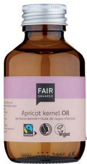
APRICOT KERNEL OIL (ORGANIC)

100 ML BOTTLE, ART.-NO.: 4910302 EAN: 4260365850801