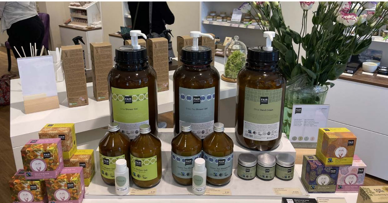
Presentation at Barbara Green Cosmetics, Münster