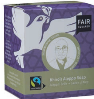
KHIRO'S ALEPPO SOAP

160 G, ART.-NO.: 4910452 EAN: 4260365857879