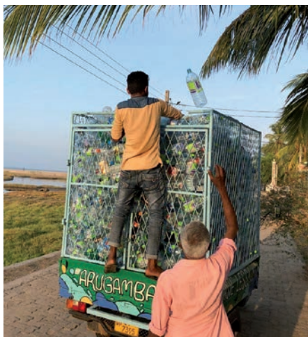
Collecting plastic bottles: Upcycling project on Sri Lanka