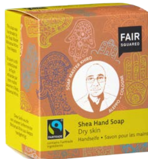
HAND SOAP SHEA DRY SKIN

160 G, ART.-NO.: 4910450 EAN: 4260365857855