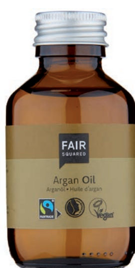
ARGAN OIL (ORGANIC)

500 ML BOTTLE, ART.-NO.: 4910304 EAN: 4260365850986