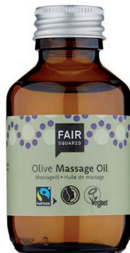
MASSAGE OIL OLIVE

500 ML BOTTLE, ART.-NO.: 4910515 EAN: 4260365857435