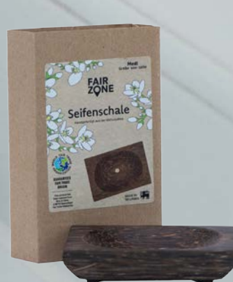
FAIR TRADE SOAP DISH MAXI MADE FROM THE KITHUL PALM TREE