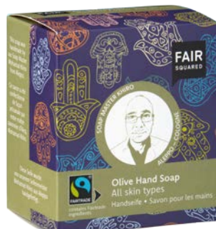
HAND SOAP OLIVE ALL SKIN TYPES

160 G, ART.-NO.: 4910451 EAN: 4260365857862