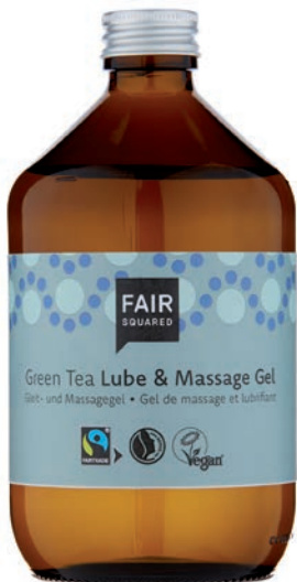
LUBE & MESSAGE GEL GREEN TEA

Natural, water soluble care product, which can be used for body massage as well as a lubricant. The pleasantly gentle formula with fairly traded green tea helps to relieve physical tensions and helps the skin to regenerate. Green tea has been used in Chinese medicine for centuries for its rejuvenating and healing effect. This product is condom compatible and does not change the pH value of the vaginal flora.