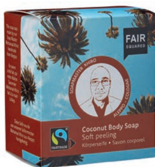
BODY SOAP COCONUT SOFT PEELING

160 G, ART.-NO.: 4910271 EAN: 4260365856049