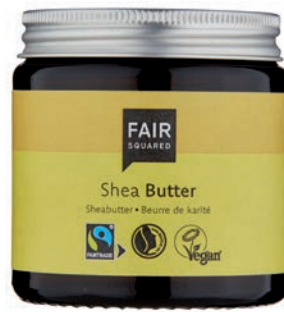
SHEA BUTTER (ORGANIC)

As a retailer, take the opportunity and decide in favor of our pure Fairtrade oils and fats in organic quality.