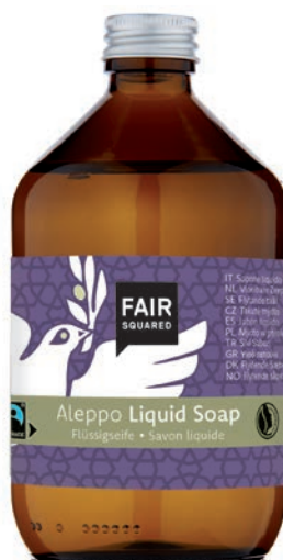
LIQUID SOAP ALMOND

The liquid soap for particularly sensitive skin. In addition to the fairly traded olive oil, valuable almond oil has been added. It is known to be particularly moisturizing and skin smoothing.