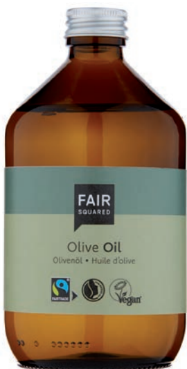
OLIVE OIL (ORGANIC)

100 ML JAR, ART.-NO.: 4910303 EAN: 4260365851099